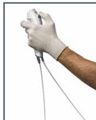
Ergonomic and lightweight handle designed for optimal user comfort